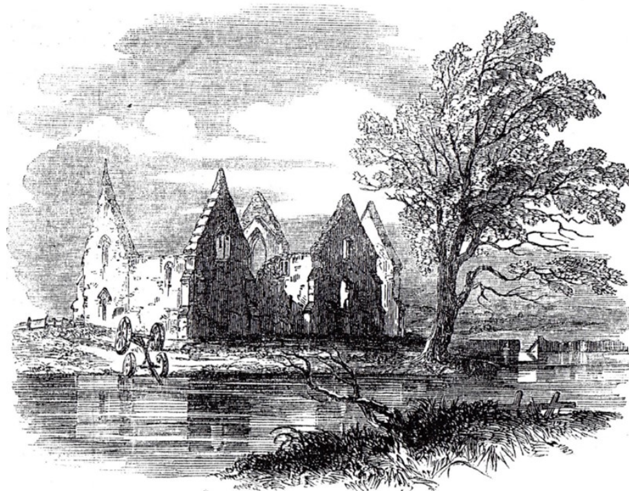
REMAINS OF KILVE CHANTRY.

On one of my many 'restricted walks' during this latest lockdown, I was passing by the Chantry ruins when I was approached by a fellow Kilve resident who remarked that it would seem that English Heritage were about to embark on some more work at the Chantry. They also enquired of me if I knew more about the history of the Chantry and particularly when it became so derelict. Well, some 16 years ago I printed in Kilve News an article which originally appeared in the Illustrated London News of November 25th 1848 and I thought that so many of you who have moved in to the village since my last article in 2005 would be interested in it being published once again. All the spellings, capitals and punctuation are as in the original publication.