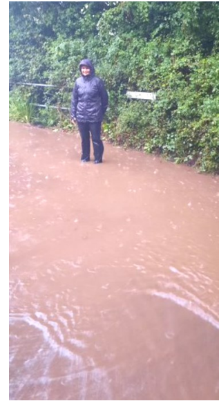
The flooded road before work started.

A huge amount of overgrowth was cleared from the area nearest the road, revealing the outflow culvert and trash screen still