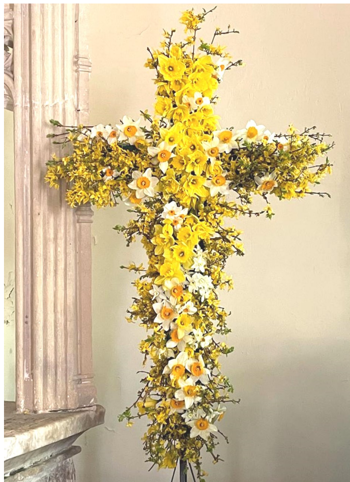
Beautiful Easter flowers from St Mary's, East Quantoxhead